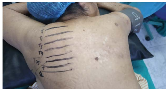
PICTURE 1: Localising the dermatome level with ultrasound using spinous processes of thoracic spine

The patient was placed in a prone position and after taking all necessary aseptic precaution, a high-frequency linear ultrasound transducer was placed in an axial orientation first to accurately localise the dermatome level using the spinous processes of thoracic spine (Picture 1).